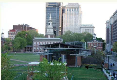
View from the balcony. What would Billy Penn and Ben Franklin say about this now!