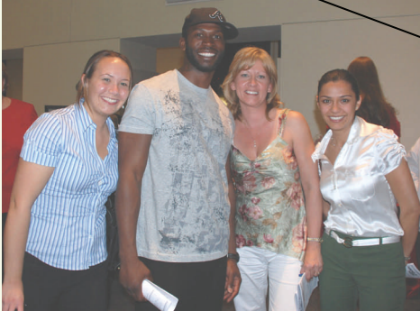
Eagles guests are always a hit.