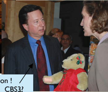
His parent company's foundation has given thousands of dollars to the Children's Alliance.