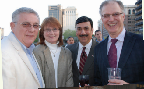
Ran a Marathon to raise $4,000 to for the Children's Alliance.